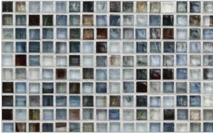
1/2 x 1/2 Mini Mosaic (12 mm x 12 mm)