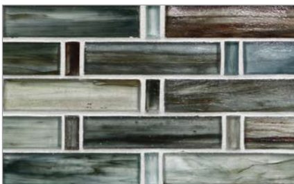
Tresse (1/2 x 1 & 1 x 4) (12 mm x 25 mm & 25 mm x 100 mm)