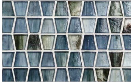
Wings (1 x 1) (25 mm x 25 mm)