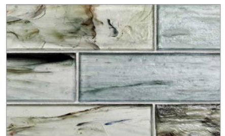
2 x 6 Brick (51 mm x 160 mm)