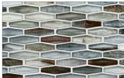
Martini (5/8 x 2) (15 mm x 50 mm)