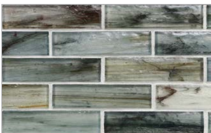
1 x 4 Brick (25 mm x 100 mm)