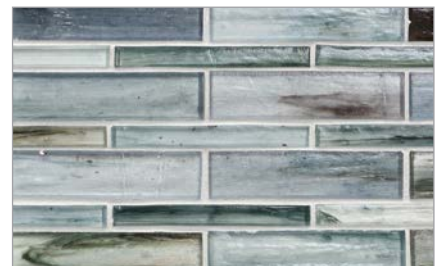
Moyou (1/2 x 4 & 1 x 4) (12 mm x 100 mm & 25 mm x 100 mm)