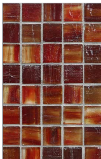
Natural Marrakech Red