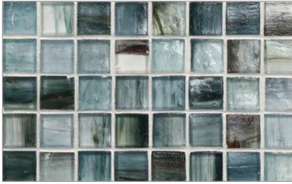
1 x 1 Mosaic (25 mm x 25 mm)