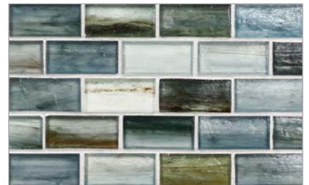
1 x 2 Brick (25 mm x 51 mm)