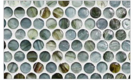
Penny Round (3/4") (20.75 mm Round)