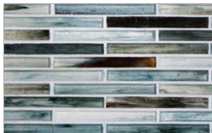
1/2 x 4 Brick (12 mm x 100 mm)