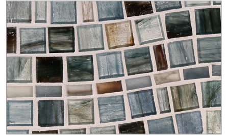
Rio (1/2 x 1 & 1 x 1) (Pearl and Silk) (12 mm x 25 mm, 25 mm x 25 mm)