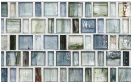
Japonaise (1/2 x 1 & 1 x 1) (12 mm x 25 mm, 25 mm x 25 mm)