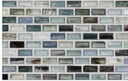
1/2 x 1 Mini Brick (12 mm x 25 mm)